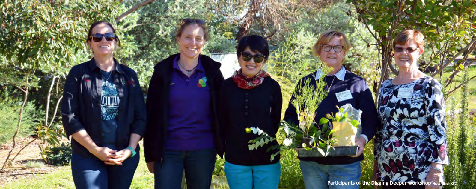
Participants of the Digging Deeper workshop