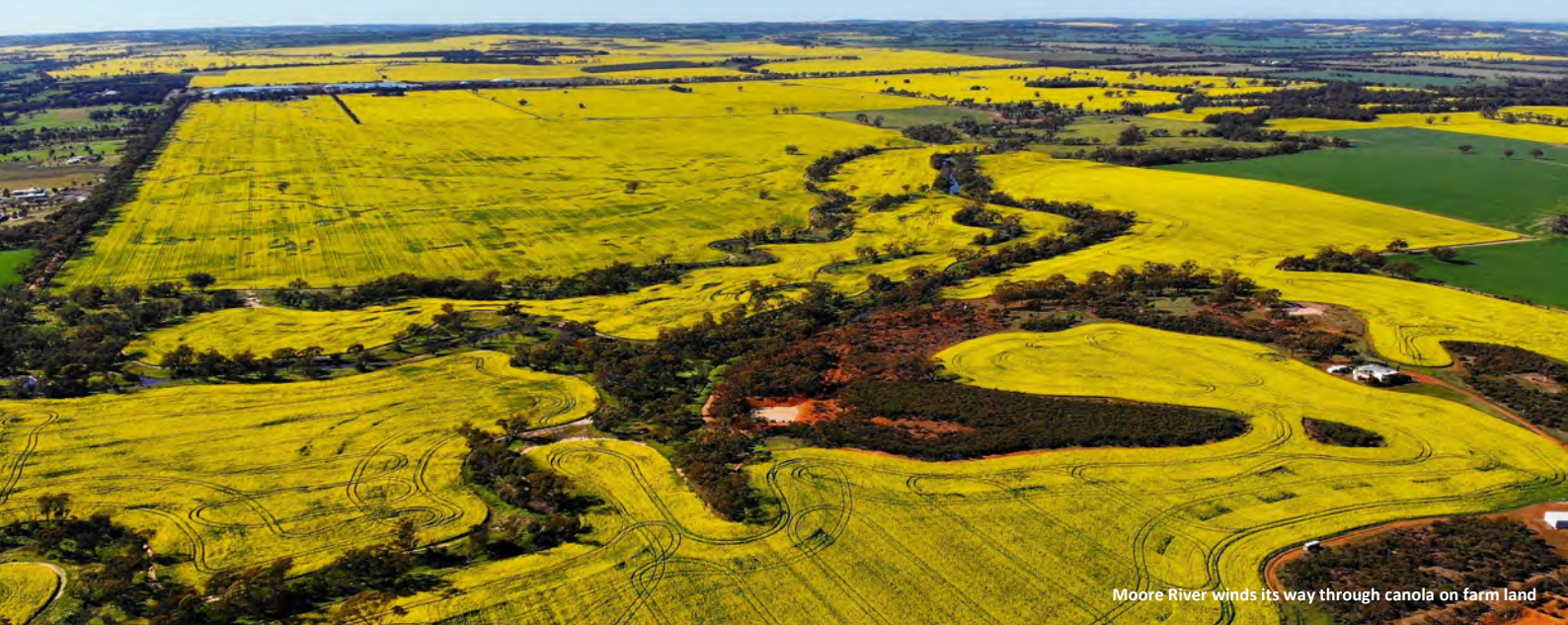
Moore River winds its way through canola on farm land