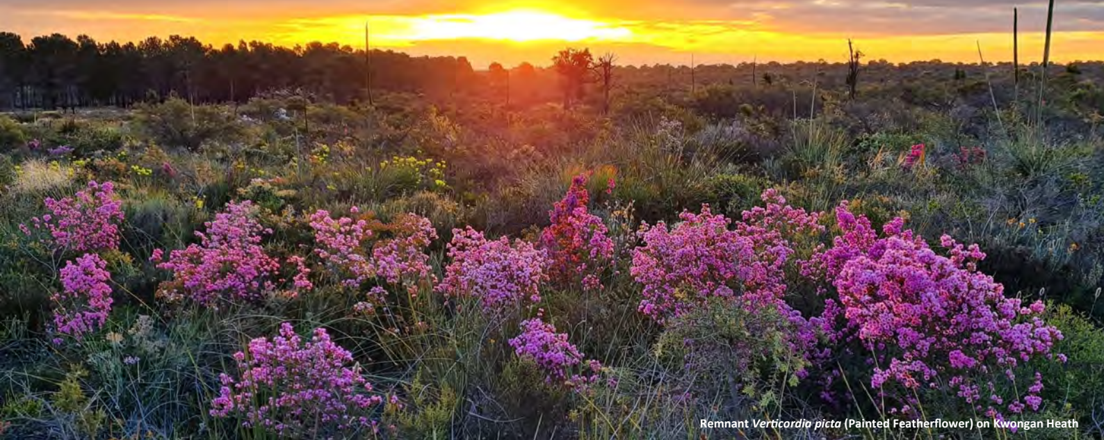
Remnant Verticordia picta (Painted Featherflower) on Kwongan Heath