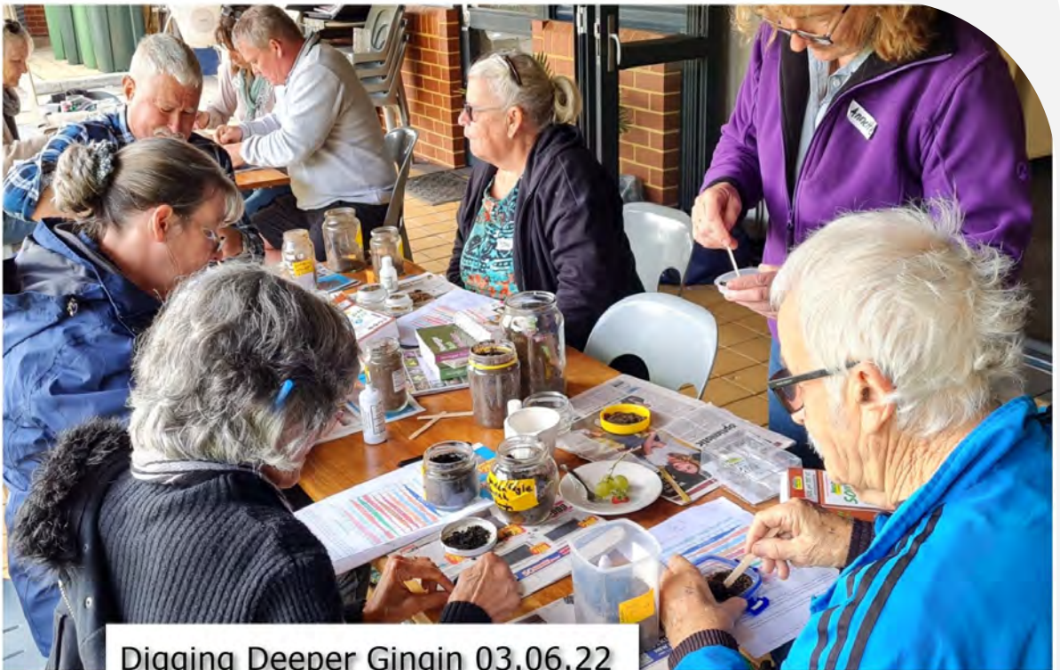
Digging Deeper Gingin 03.06.22