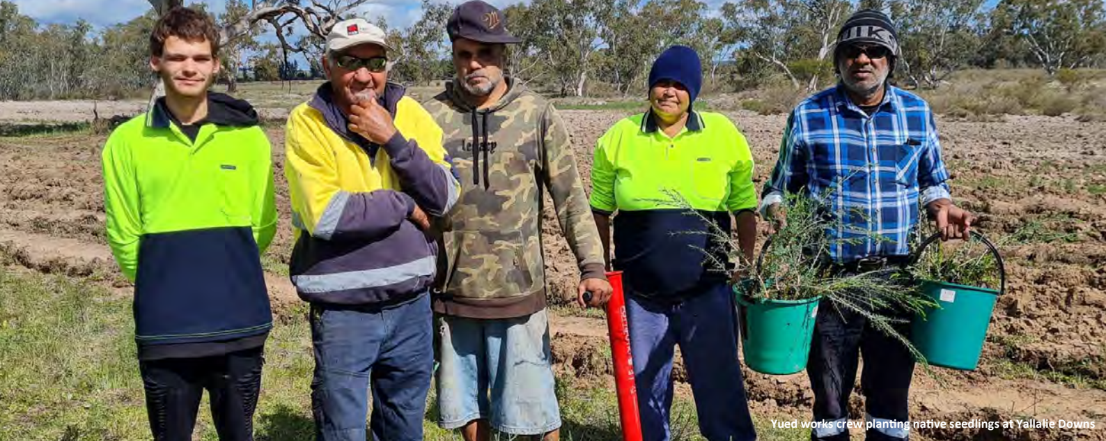
Yued works crew planting native seedlings at Yallalie Downs