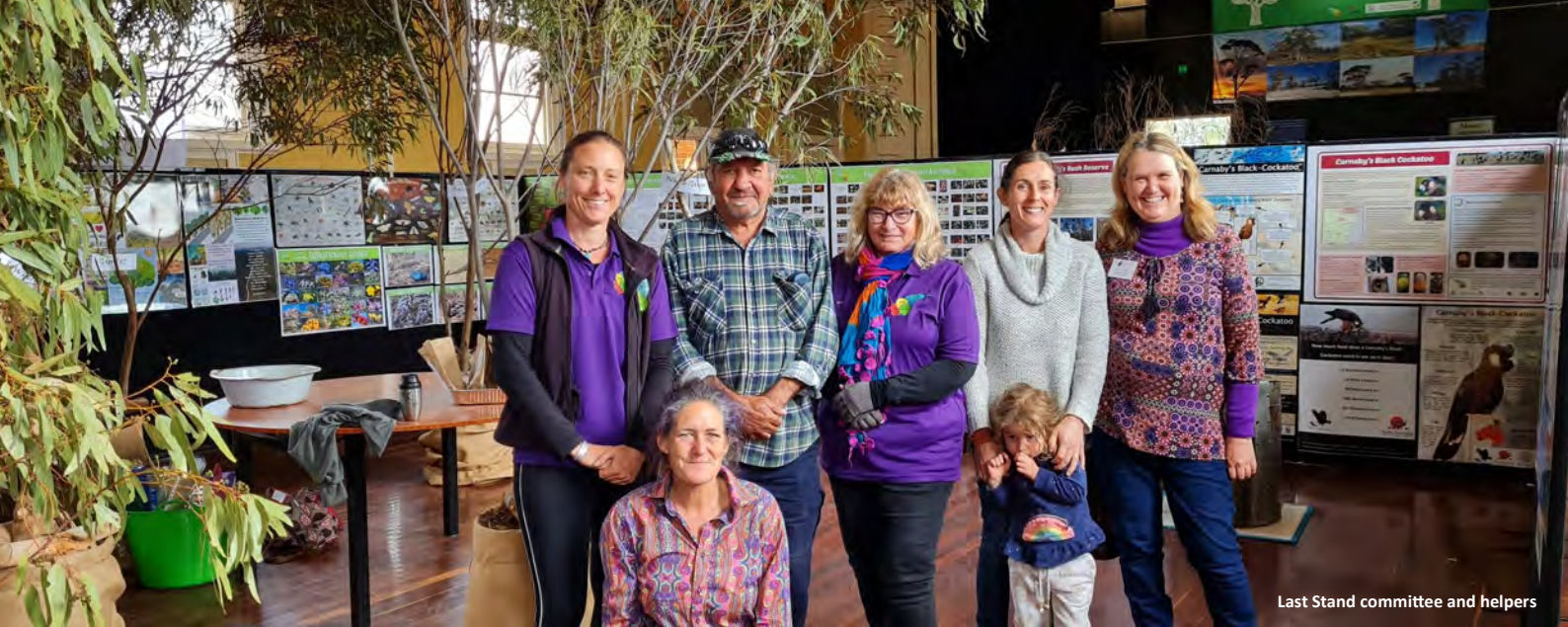
Last Stand committee and helpers