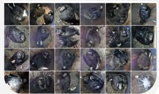
Carnaby's Black Cockatoo chicks born in artificial log nests who survived to fledge, Moora WA 2021-22 season

4.5km fence installed along Moore River to protect the native corridor from stock