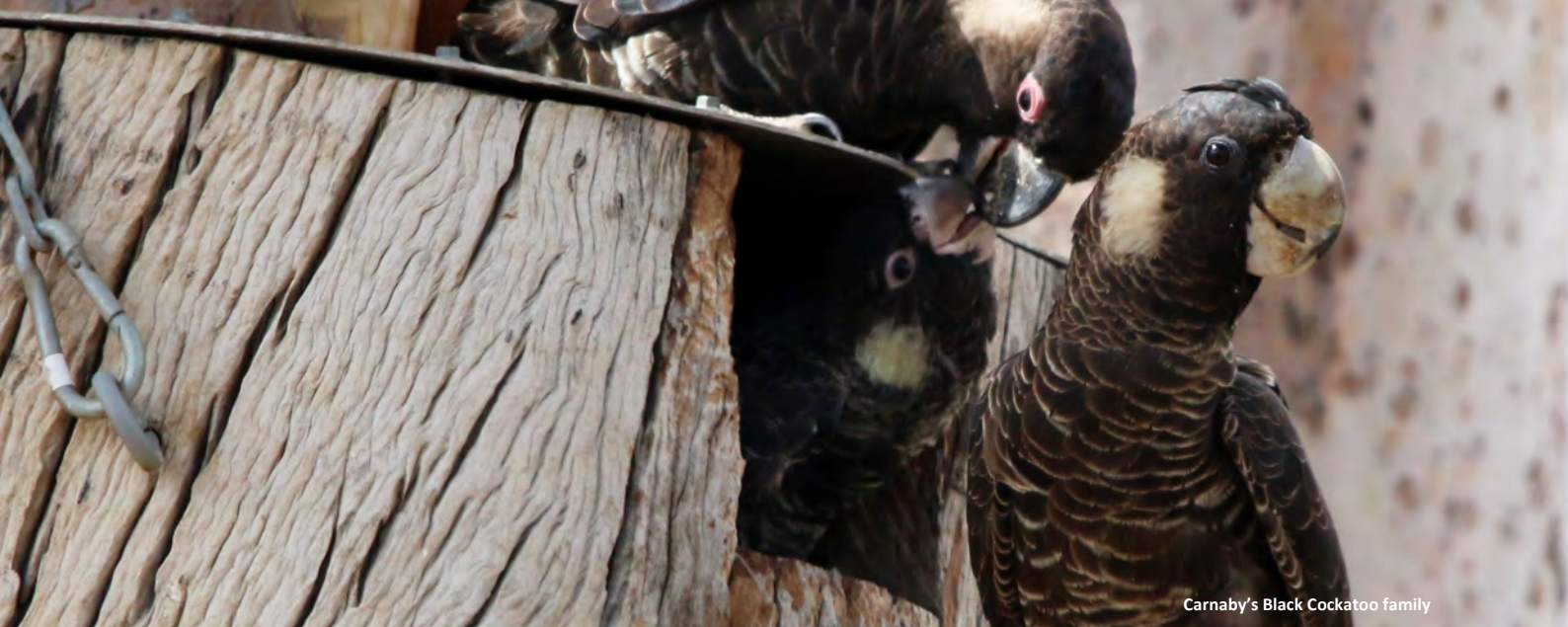
Carnaby's Black Cockatoo family