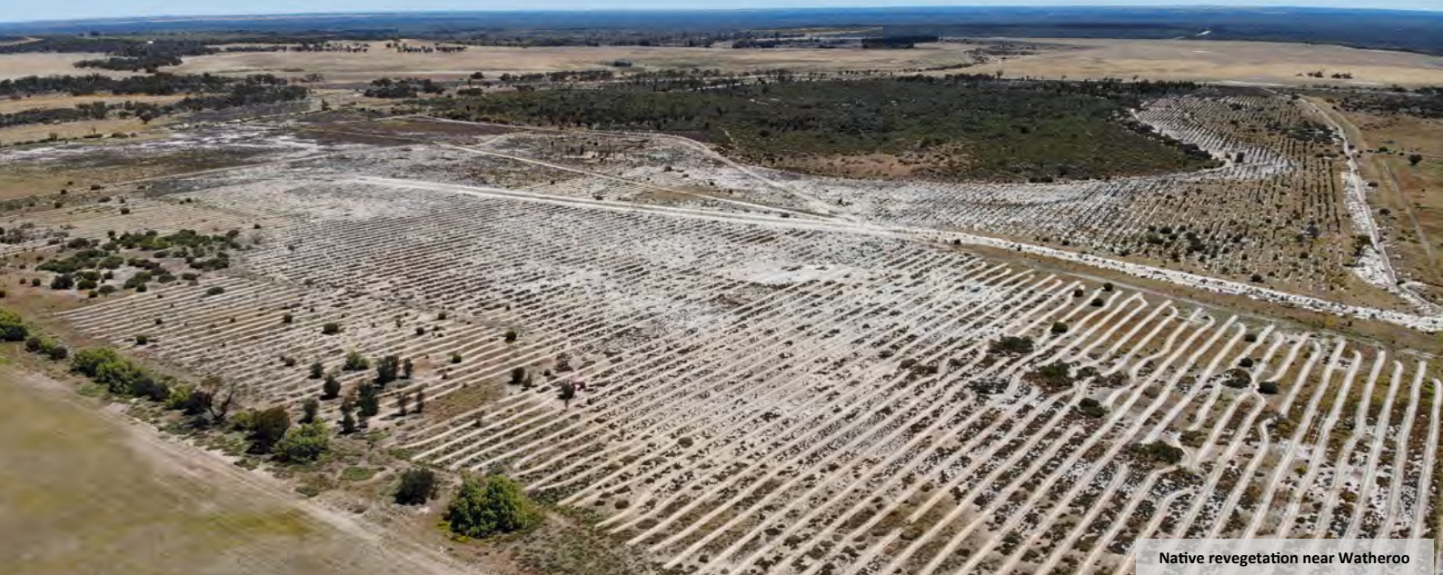
Native revegetation near Watheroo