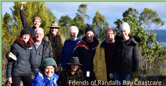
Friends of Randalls Bay Coastcare

It is also the habitat of Tasmanian devils (rarely seen during the day). Walkers will also enjoy a diversity of plants, from old-growth eucalypts and native grasses to delicate orchids. While the lower part of the track will be suitable for casual walkers, the climb to the summit, which will take about an hour and a half return, is of medium difficulty and more suitable for reasonably fit bushwalkers. It is hoped that the new walking track may be officially opened and ready for public use before Christmas and the summer holiday period.