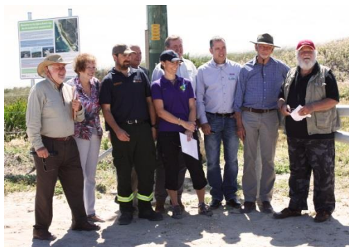
Stakeholders of the North Dune project