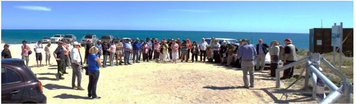
Huge attendance at the opening of Guilderton's Djena Koorkl-iny walk trail

Guilderton has always been a special place to many but its wonderful natural assets are becoming more and more threatened from increasing visitor numbers. The Guilderton Celebration Day on Friday 24 th October saw around 80 people from all sectors come together to celebrate three projects that are helping to conserve the fragile dunes and Moore River estuary for the future. The day was organised by the Guilderton Community Association (GCA), Shire of Gingin (SG) and Moore Catchment Council (MCC), and started with the official opening of the Djena Koorkl-iny (meaning 'go on foot' in Noongar) walk trail north of town.