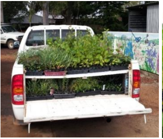
Fitting 2,000 seedlings on the ute