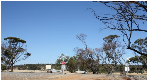
Above: sick trees at Coomberdale wildflower farm crossing

This evidence was brought to the attention of the Department of Parks and Wildlife (DPaW) who forwarded the information on the Brookfield Rail. As a result, MCC organised a meeting on 23<sup>rd</sup> January between Brookfield Rail, rail maintenance contractor John Holland, Shire of Moora, DPaW, Roadside Conservation Committee and local concerned residents to discuss what has happened and what can be done to remedy the situation. Frank discussion were held between the stakeholders about Brookfield Rail's herbicide spraying practices along the rail line and the huge devastating consequences that will result from the loss of these trees. A residual herbicide chemical is thought to be the blame with the John Holland representative explaining that 2013 was the last year of a three year program using this chemical alongside Glyphosate to help control the weeds - especially the resistant rye grass. York Gums, Salmon Gums and Wandoo have lateral root systems that extend to at least once to twice the height of the tree and so the chemical could have infiltrated the soil to roots