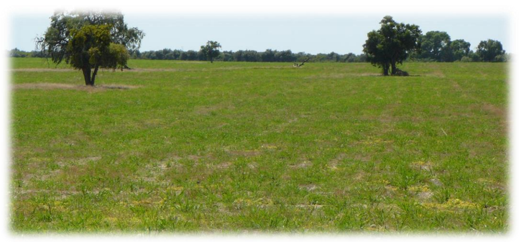
Good establishment methods will improve production (Coomberdale perennials on white sand 2011)

This project will investigate and demonstrate a variety of proven soil amelioration techniques to improve the soil quality at the root zone. This will include applying organic matter, clay spreading, and spading and deep ripping. A field walk at the Koojan farm will help communicate results and key learnings in Spring 2014.