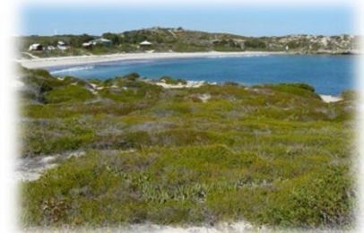
Beautiful Dynamite Bay

Everyone then reboarded the bus for the return trip which included a stop off at Grigson's Lookout between Green Head and Jurien. This scenic lookout offers fantastic 360 degree views across the dunes and inland lakes. Kingsley talked about the evolution and uniqueness of the Turquoise coast vegetation and Charlie Shaw shared some of the dreamtime stories passed down relating to the formation of the land by the mystical animals.