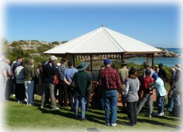
Green Head rotunda

The bus then made its way to Green Head where the group was met by the Green Head Coastcare group who won the prestigious 2011 State Landcare award for top Coastcare Group. The group's volunteers and Penny then took everyone on a tour of some of the rehabilitation works that had been carried out and also explained future projects including upgrading the footpaths for improved access. A fabulous lunch spread was on offer back at the rotunda and everyone filled their plate with salads, sandwiches and savoury bites plus delicious desserts, and then listened to Nic Dunlop from Conservation Council WA talk about the Citizen Science Project followed by Charlie Shaw of the Yued Aboriginal Group who gave insight to the Indigenous heritage of Green Head.