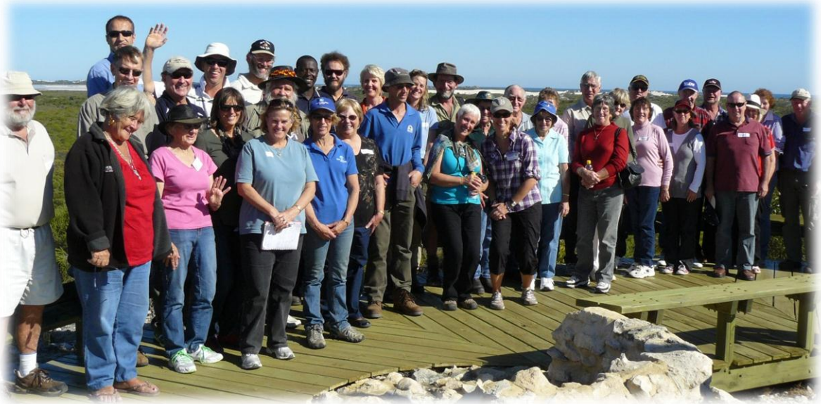
Turquoise Bus tour participants