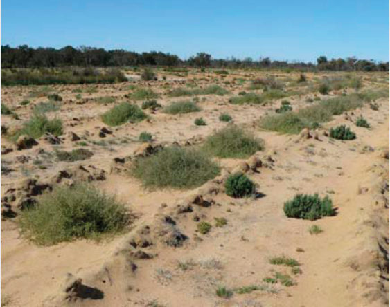
Now: Site as it looks today with year old river saltbush in rows