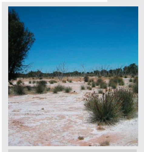
Before: Salt scold two years ago -bare & unproductive