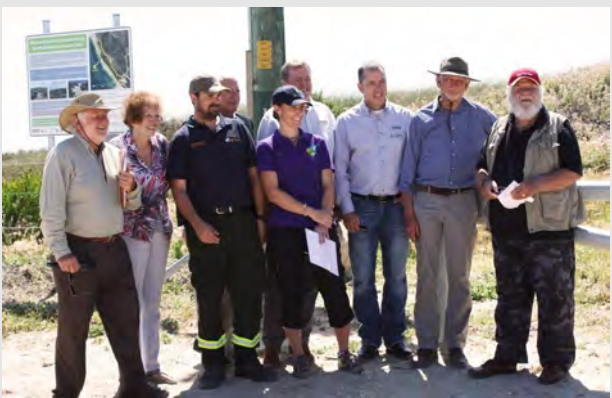
Stakeholders of the North Dune project

trail interpretive signage design and installation."