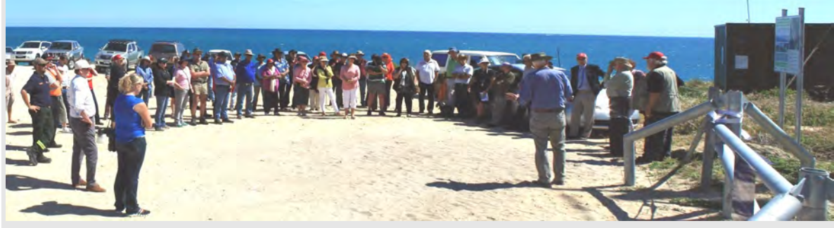
Huge attendance at the opening of Guilderton's Djena Koorl-iny walk trail

Guilderton has always been a special place to many but its wonderful natural assets are becoming more and more threatened from increasing visitor numbers. The Guilderton Celebration Day on Friday 24<sup>th</sup> October saw around 80 people from all sectors come together to celebrate three projects that are helping to conserve the fragile dunes and Moore River estuary for the future. The day was organised by the Guilderton Community Association (GCA), Shire of Gingin (SG) and Moore Catchment Council (MCC), and started with the official opening of the Djena Koorl-iny (meaning 'go on foot' in Noongar) walk trail north of town.