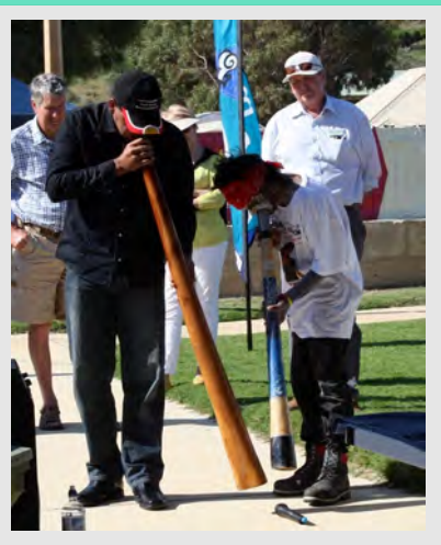
Celebrations at the estuary gazebo