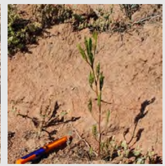
Eucalypt sp Hakea recurva